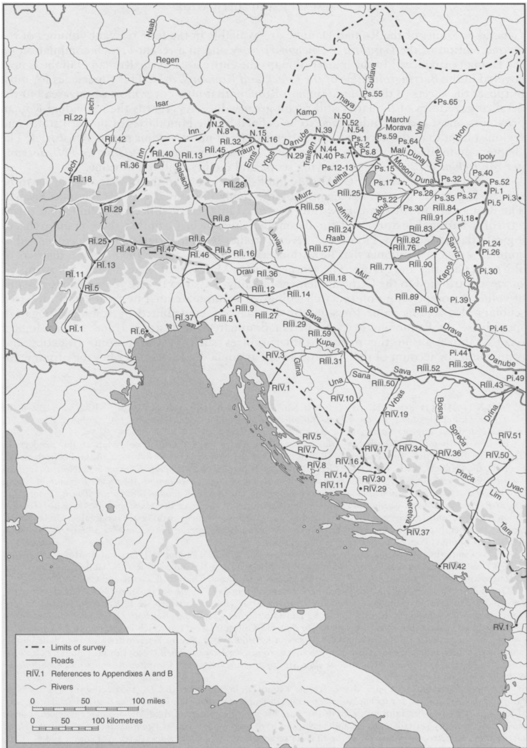
FIG. 1. The Roman Danube: routes and stations to the Danube (Appendix A) and principal locations on and near the Danube (Appendix B).